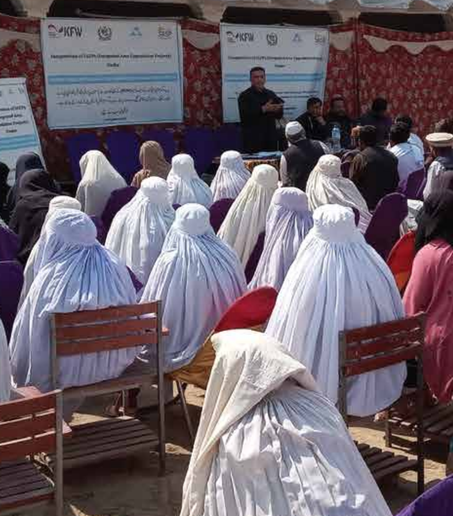
Discussion with community members on project implementation in DI Khan, Khyber Pakhtunkhwa.

LACIP is an integrated poverty reduction programme funded by Federal Republic of Germany through KfW that aims to contribute towards the improvement of living conditions of vulnerable communities by building disaster-resilient Community Physical Infrastructure (CPI) and generating employability through Livelihood Enhancement and Protection interventions with Institutional Development as the basis for all the activities. PPAF is the lead implementing agency of LACIP through its Partner Organisations (POs).